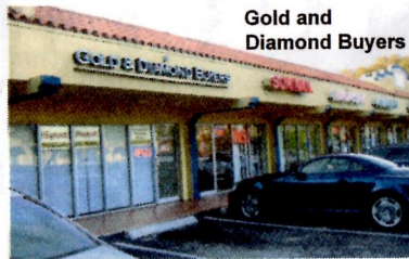
Gold and Diamond Buyers